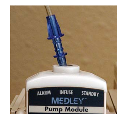
If You Observe Any of These Conditions, Close The Roller Clamp and Reload The Set Upper Fitment into The Receptacle

In these illustrations, the upper fitment is elevated above the receptacle on the Medley™ Pump Module. It was likely caused by maintaining traction on the set while closing and latching the door. If the set is loaded in this manner you may experience infusion rate inaccuracy.